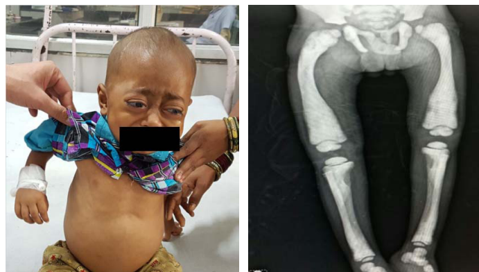
[Table/Fig-2]: Protruded eyes with abdominal distension due to hepatosplenomegaly. [Table/Fig-3]: Erlenmeyer flask deformity of femur.