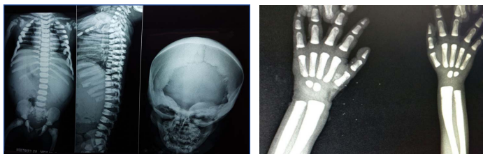
[Table/Fig-4]: Skull radiograph showing wide diploic space (right) and radiograph of spine showing 'sandwich' appearance of vertebrae. [Table/Fig-5]: Increased bone density and 'bone in bone' appearance of phalanges (Images left to right).

complications. The definitive cure of osteopetrosis is human stem cell transplantation. It is usually done in severe forms of osteopetrosis due to high associated morbidity and mortality. Vitamin D supplementation to stimulate osteoclast, corticosteroid and erythropoietin to treat anaemia and gamma interferon to improve immunity are used. Infantile malignant osteopetrosis is associated with diminished life expectancy while it is normal for adult forms.